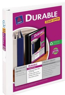
Clear Cover 1 inch binder